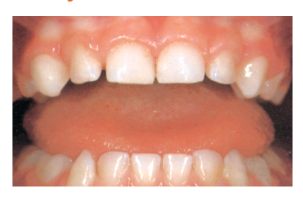
Early cavities - White spot lesions