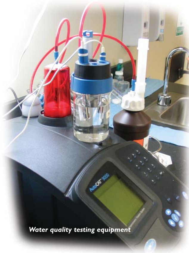
Water quality testing equipment

This innovative program focuses on a collaborative approach between water suppliers and our Drinking Water Officers. The program includes conditions on operating permits that promote improved drinking water quality.