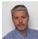
Wrae Hill PQI Consultant (IH Central)