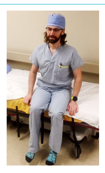
Step 6. Slide forward to the edge of the bed