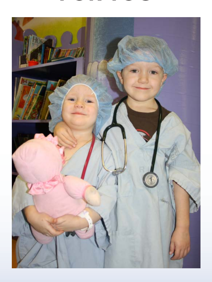
What happens when you need an operation?