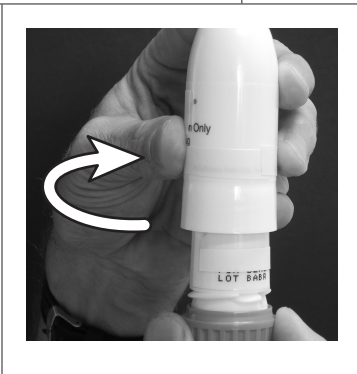
6. Twist the cap on.