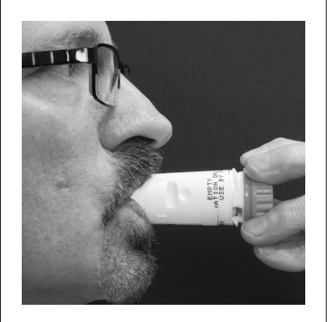
4. Put the Turbuhaler<sup>®</sup> between your teeth and seal your lips around it. Breathe in very fast, until your lungs are full.