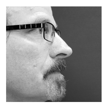
5. Remove the Turbuhaler<sup>®</sup> and hold your breath for 10 seconds, if you can. Breathe out. If you need to take another puff repeat steps 2 to 5.