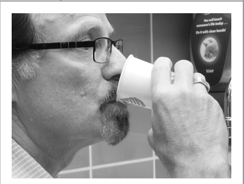
7. Rinse, gargle and spit out.