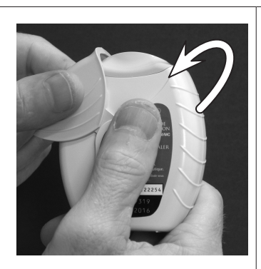
I. Slide open. Hear a click.