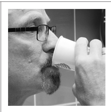
7. Rinse , gargle and spit out.