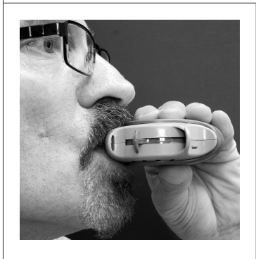
4. Put the Diskus® between your teeth and seal your lips around it. Breathe in as fast as you can until your lungs are full.