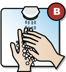
Clean hands with A) Hand foam/gel or B) soap and water