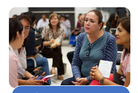
Action #16:_ Collaborate with external partners on climate adaptation and mitigation