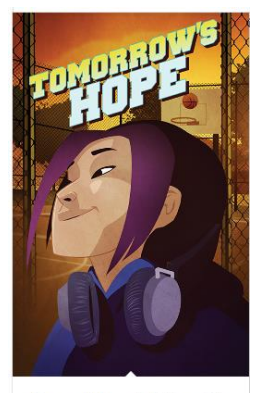
Tomorrow's Hope - First Nation suicide

Don't forget we do custom work - posters, video and graphic novels. Please send an email to <u>sean@istorystudio.com</u> if you're interested in connecting with youth and have a budget.