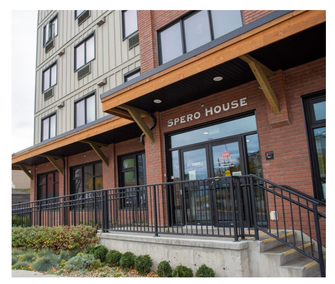
Spero House Supportive Housing, Kamloops